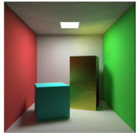
Figure 10: Scene with brushed yellow metal box. Path-buffer traced with depth 3 using 1024 paths/pixel.