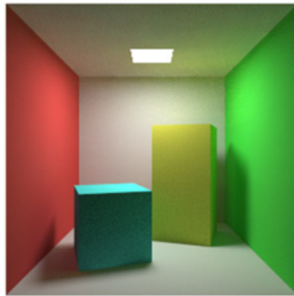
Figure 9: Path-buffer gather from radiosity solution using 1024 paths/pixel.