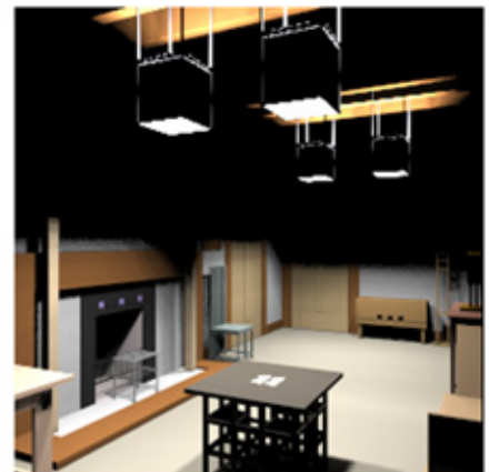
Figure 13: Room with direct lighting only.