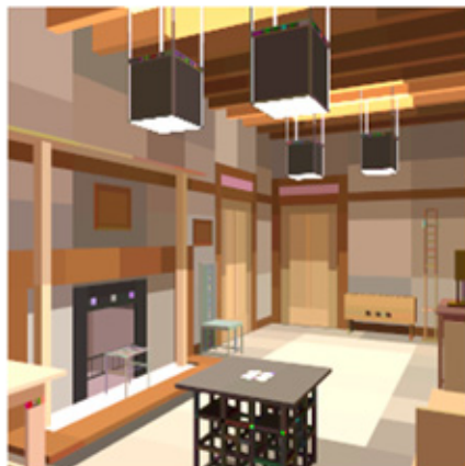
Figure 11: Monte Carlo radiosity solution on diffuse complex room scene.