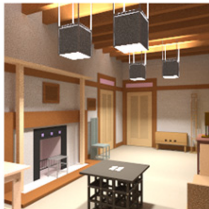
Figure 12: Path-buffer gather from radiosity solution using 4096 paths/pixel.